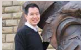
Martin finds travel and food photography (taken with a Canon S95) a pleasurable distraction.

Enjoy, share and spread your unique brand of love wherever you go. ■