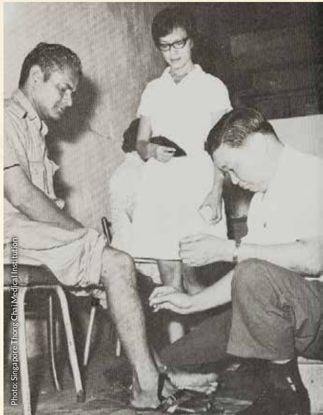
A Thong Chai physician performing acupuncture on a patient