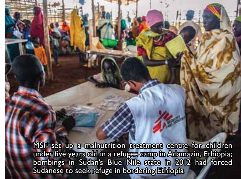
MSF set up a malnutrition treatment centre for children under five years old in a refugee camp in Adamazin, Ethiopia; bombings in Sudan's Blue Nile state in 2012 had forced Sudanese to seek refuge in bordering Ethiopia