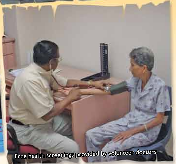
Free health screenings provided by volunteer doctors