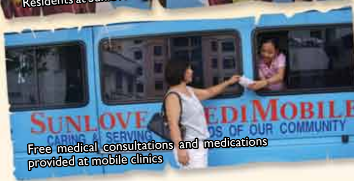
Free medical consultations and medications provided at mobile clinics