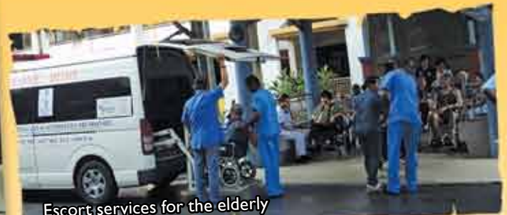
Escort services for the elderly