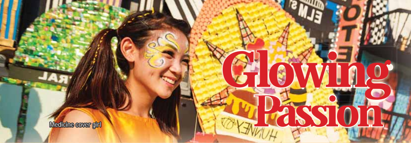
Medicine cover girl