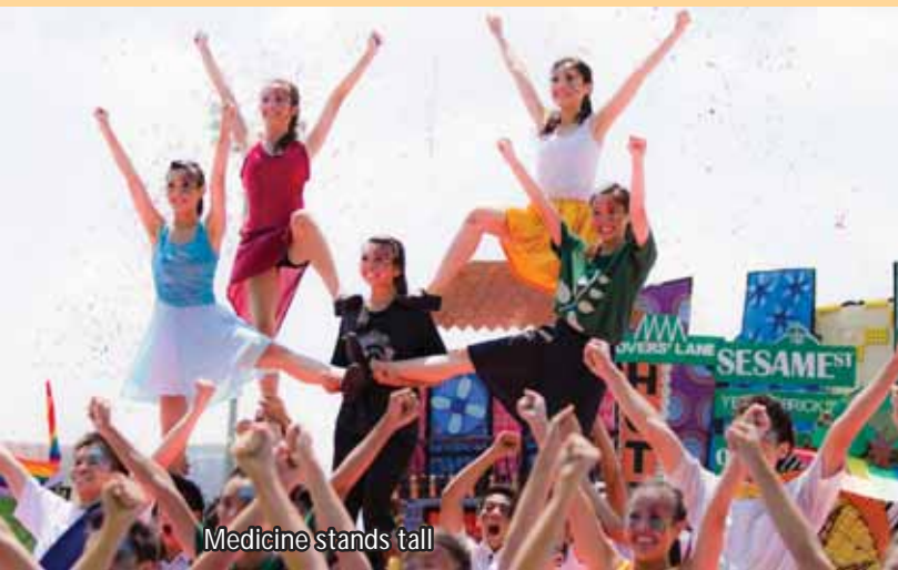
Medicine stands tall

For Flag Day 2012, held on 7 August, the NUS student body approached members of the public for donations which benefited 20 beneficiaries under the Community Chest's umbrella.