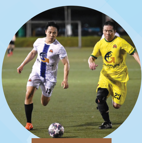
Complete focus on the target