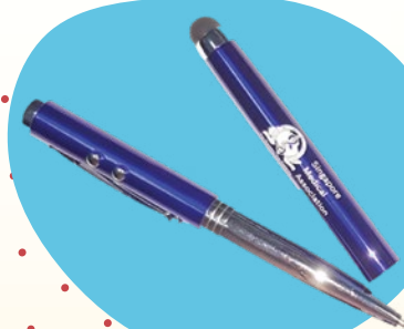
SMA 4-in-1 Multi Pen