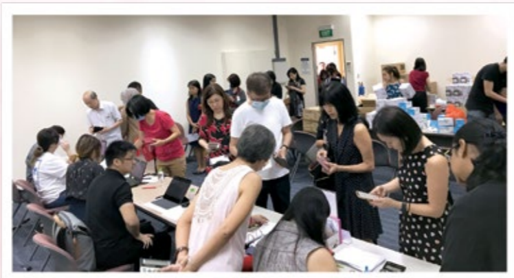
The large crowd of HCWs purchasing masks

SMA played its part in the growing COVID-19 crisis in its own way! To help front line healthcare workers, SMA procured N95 and surgical masks for sale to Members to ensure they are sufficiently equipped to handle any potential cases. A few weeks later, in collaboration with the Temasek Foundation, SMA was mobilised again to assist with dispensing hand sanitiser for registered medical/dental clinics as well as SMA Members.