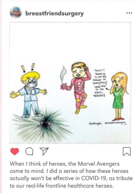
When I think of heroes, the Marvel Avengers come to mind. I did a series of how these heroes actually won't be effective in COVID-19, as tribute to our real-life frontline healthcare heroes.