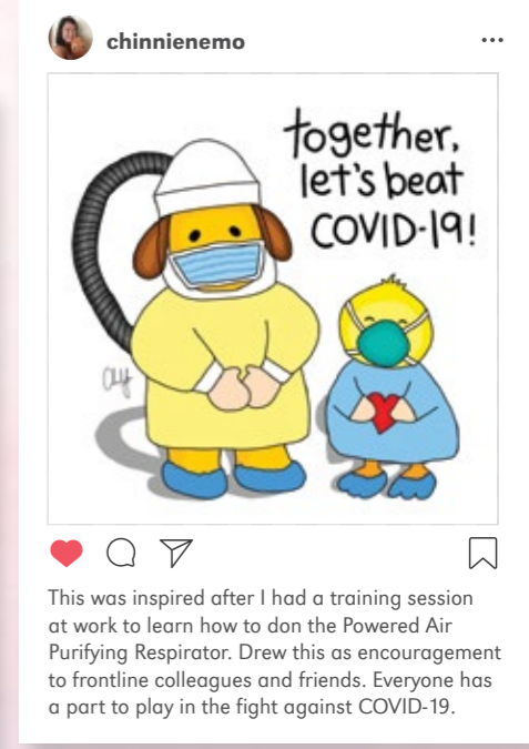
This was inspired after I had a training session at work to learn how to don the Powered Air Purifying Respirator. Drew this as encouragement to frontline colleagues and friends. Everyone has a part to play in the fight against COVID-19.