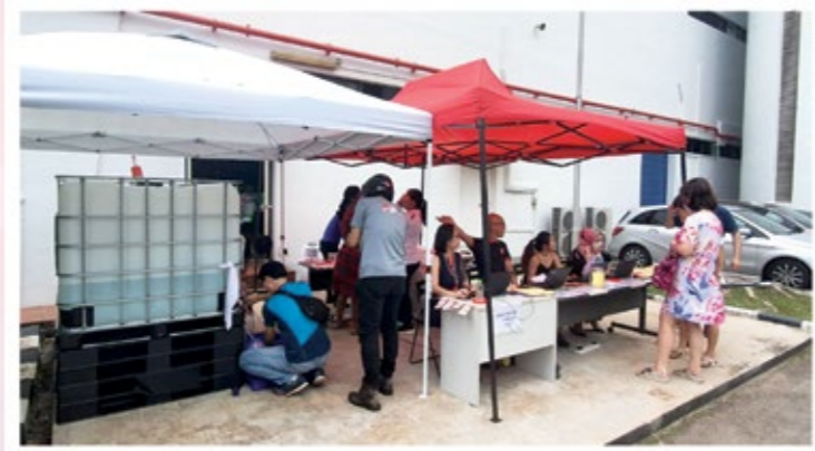
The hand sanitiser distribution setup at the outdoor parapet near the SMF carpark entrance