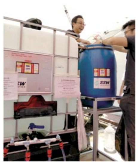
Prepping and mixing the hand sanitiser