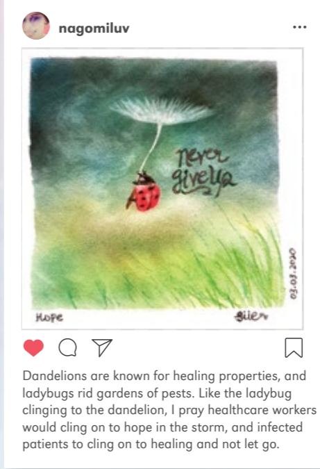
Dandelions are known for healing properties, and ladybugs rid gardens of pests. Like the ladybug clinging to the dandelion, I pray healthcare workers would cling on to hope in the storm, and infected patients to cling on to healing and not let go.