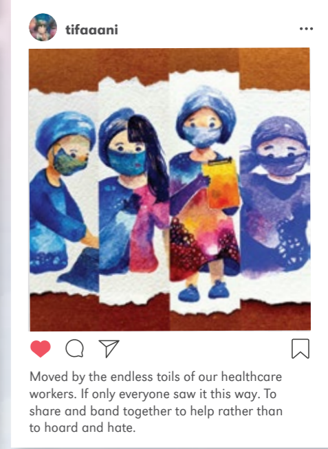
Moved by the endless toils of our healthcare workers. If only everyone saw it this way. To share and band together to help rather than to hoard and hate.