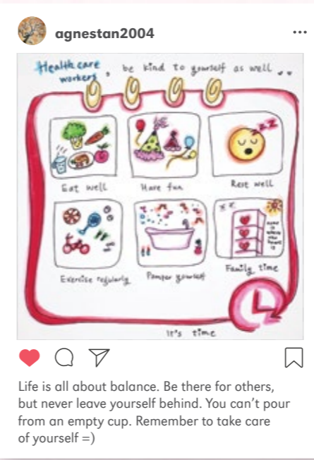
Life is all about balance. Be there for others, but never leave yourself behind. You can't pour from an empty cup. Remember to take care of yourself =)

In collaboration with the National Gallery Singapore, SMA invited members of the public to show support for front line healthcare workers (HCWs). Words of encouragement or artwork could be submitted under the hashtag #SGArtforHCW on Instagram. We've collected some of these heartwarming pieces below for our readers. ◀