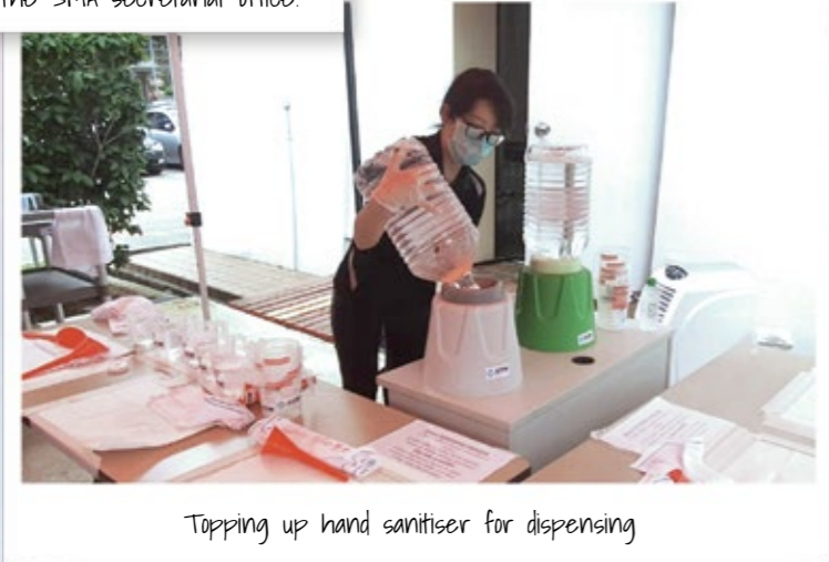
Topping up hand sanitiser for dispensing